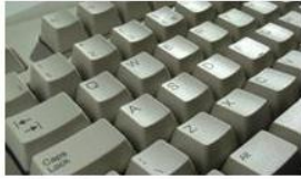
Workforce Readiness Career Center