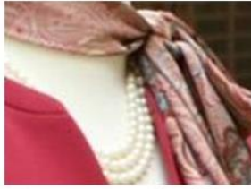
Empowerment Suiting Interview & Workplace